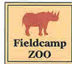
Trailblazer when necessary